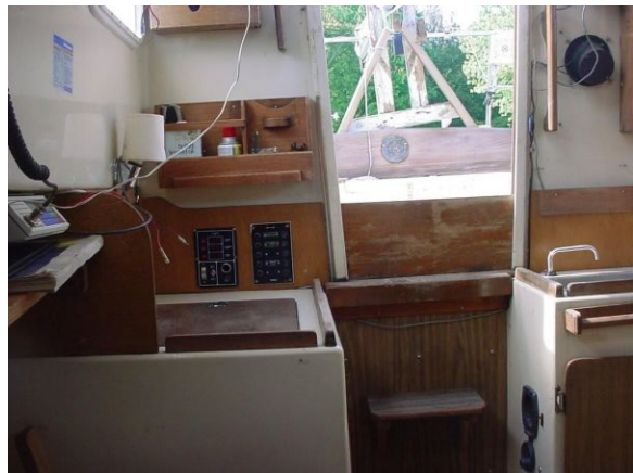
Companionway from down below