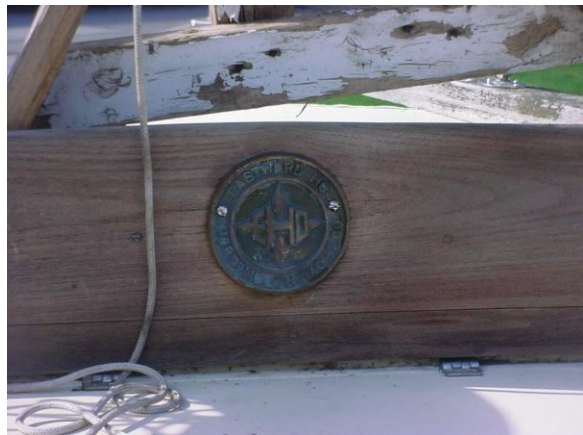
Portsmouth Eastward Ho Plaque